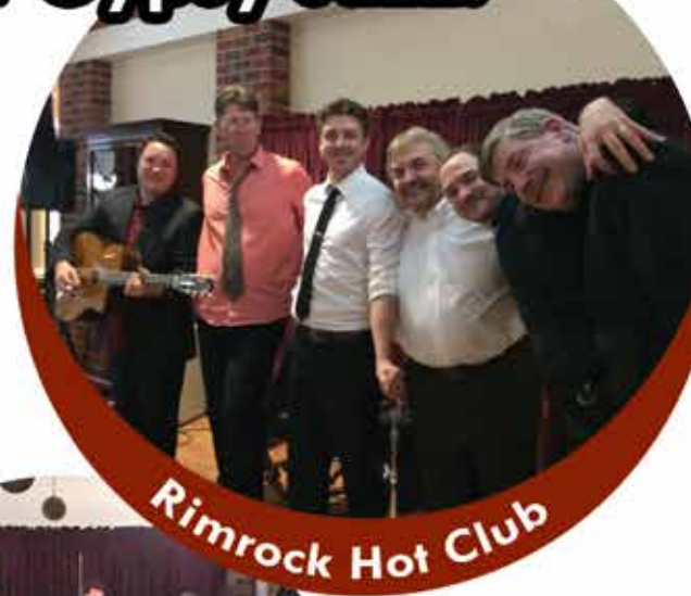
Rimrock Hot Club